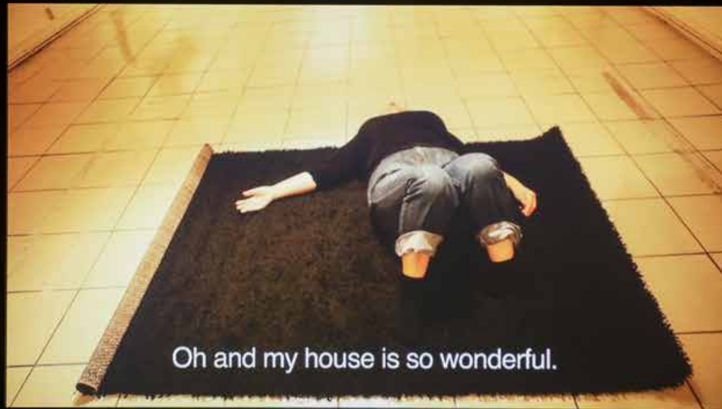
Rolls (Mum Cleaning Video) , 2012, 13mins, Installation view from Turf Projects, 2018

Rolls (Mum Cleaning Video) follows my mother and her cleaning company cleaning in various vacant houses across London. The cleaners role is to eliminate the dirt and traces of the previous inhabitants. We have claimed these temporary vacant properties as a spaces for performance to occur. The resulting footage introduces opportunities in these newly cleansed houses that collapse designated perceptions of spaces, time and ownership. For that short moment the vacant houses are places of work, play, exercise and theatricality.