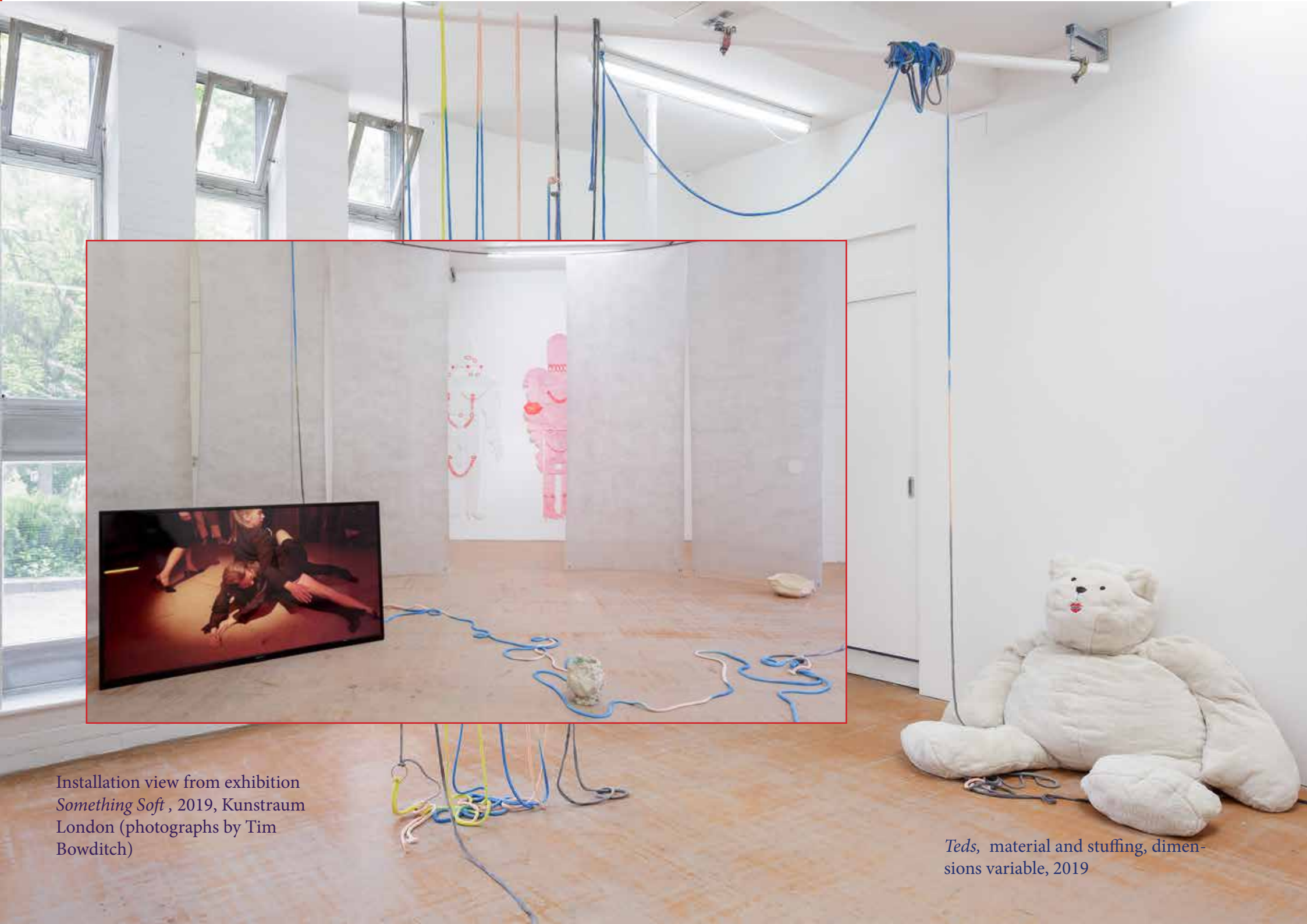
Installation view from exhibition Something Soft , 2019, Kunstraum London